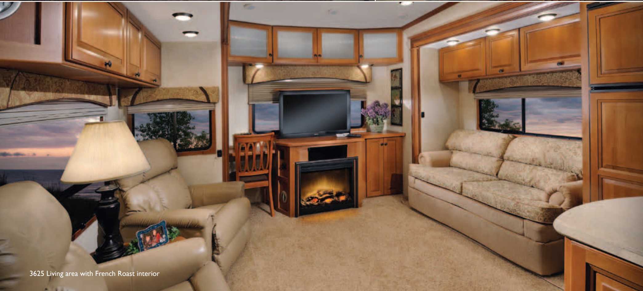
3625 Living area with French Roast interior