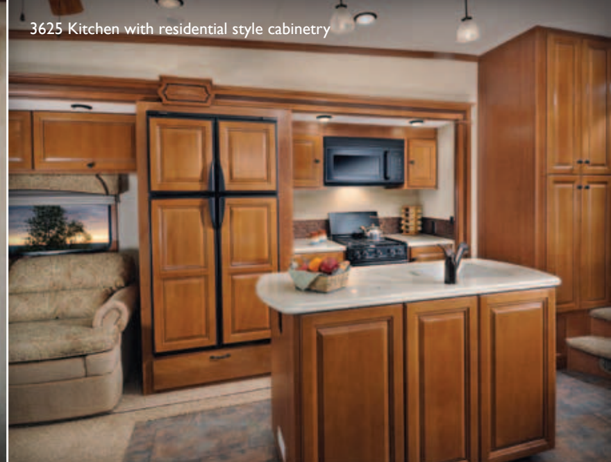
3625 Kitchen with residential style cabinetry